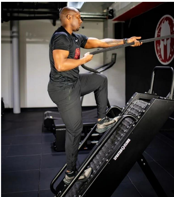
RX4400 Spartan Climber at 60 degree incline

Highly regarded for their smooth, quiet motion; bidirectional resistance; and zero inertia, ROPEFLEX products are precisely designed to accommodate a wide range of needs, floor space and budgets. From the premium RX4400 Spartan Tread Climber (one of the most popular models), to the compact and transportable RX2000 , to the simple RX505 that can be added onto a rack, beam or upright, multiple options are available at affordable price points – all backed by a generous commercial warranty.