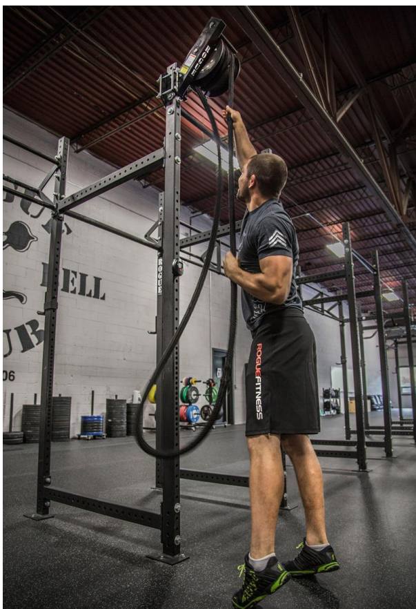
RX2100 with DSS attached to rack upright

With this abundance of advantages, plus exceptional efficiency and effectiveness, rope training is essential for anyone that wants to improve their fitness. That means gyms, studios, athletic training centers, schools/universities and PT and rehab facilities must be equipped with this increasingly popular modality. By partnering with ROPEFLEX, businesses and clientele benefit big-time.