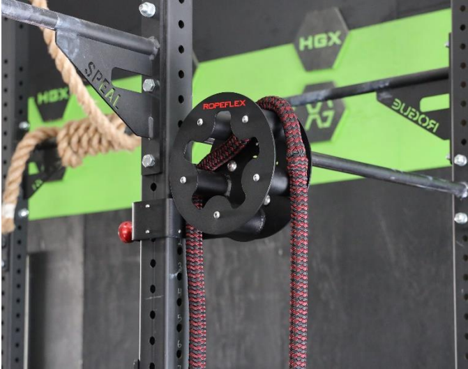
RX505 with adjustable J-hook adapter