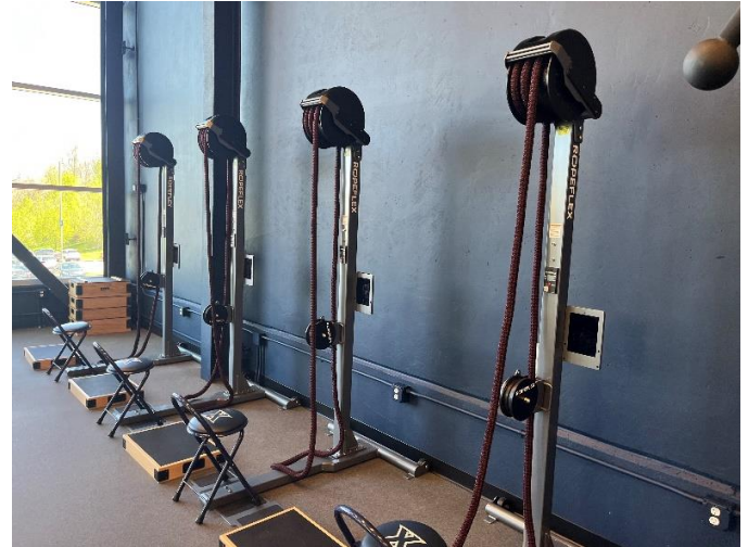
RX2500 with Hipervision at Xavier University men's basketball training facility

Don't compromise on your training tools. Ever. Prioritize performance and reap results with ROPEFLEX.